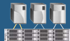
Typical deployment topologies for Sun StorageTek 2500 arrays.

Shared external DAS connectivity External DAS environments 2-3 node clusters