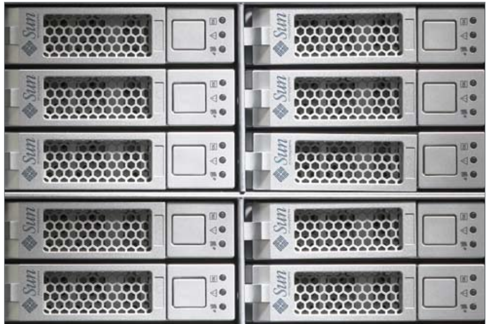
Sun StorageTek 2500 array.

Sun System Packs exceed the traditional warranty, and include 24-hour technical support by phone, extended on-site coverage hours, SunVIP™ cross-vendor/platform interoperability problem management, and access to online learning resources. Achieve flexible storage and services at a price that's less than purchasing the hardware and services separately.